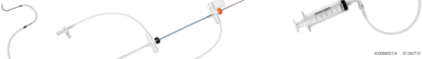
Part of the Worley Family of Advanced LV Delivery Systems