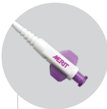
Ergonomic wing hub enhances handling and control